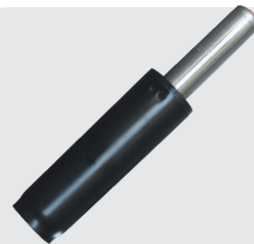
◆ With TUV Cert. Gas spring