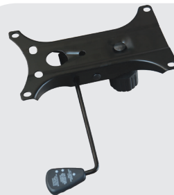
◆ Multifunction mechanism