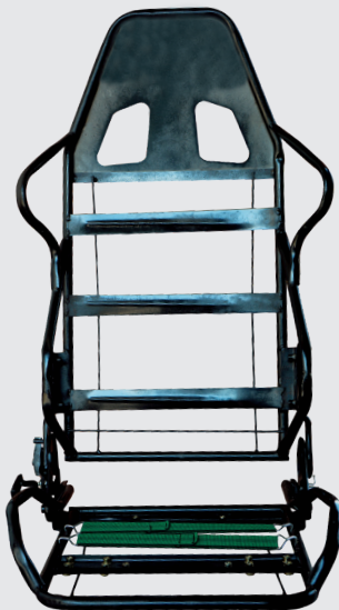
◆ Heavy duty sturdy steel frame