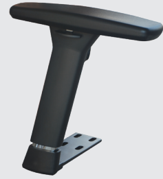
◆ 3D adjustable armrest with soft PU pad