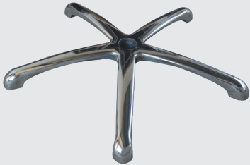
◆ With 350mm aluminium five star base