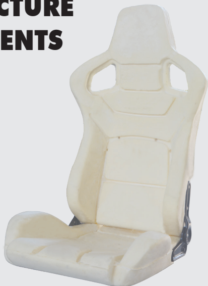
◆ High density integrated molded foam