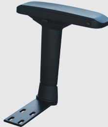
◆ 4D adjustable armrest with soft PU pad