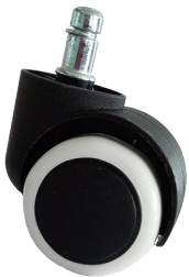
◆ Various sizes and styles of castor